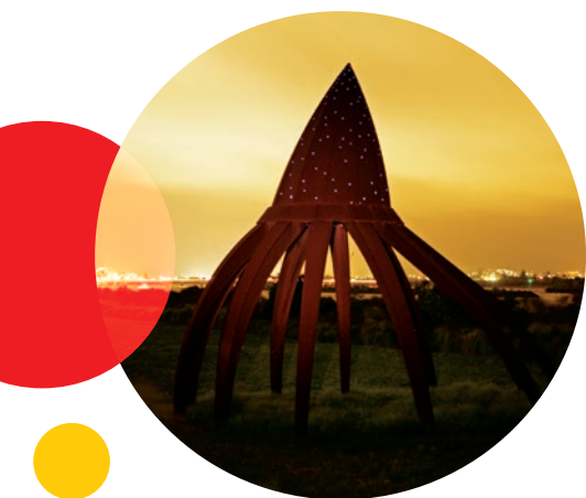
Image 9: Fiona FOLEY Sugar Cubes 2009.

The health of our rivers, fish and environment is nurtured by the quality of our mangrove stocks, and their importance is reinforced through the creation of this giant statement in steel designed to visibly age in the salty environment. The work is given an other-worldly, starry ambience by using solar-powered lights which glow through and beneath the cap in pricks of light.