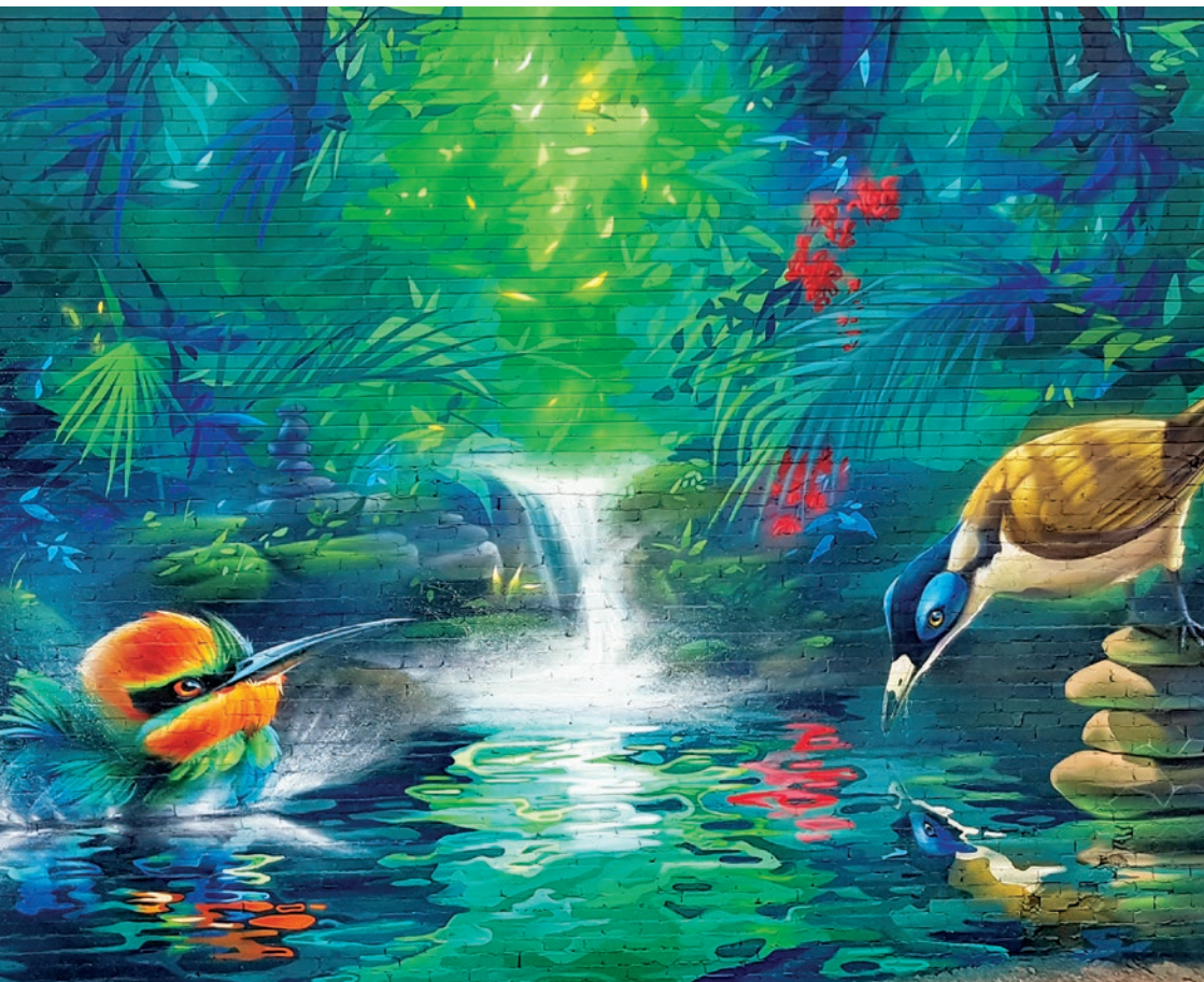
Image: Scott NAGY Finch Hatton Bird Bath 2019 Completed as part of 5th Lane Street Art.