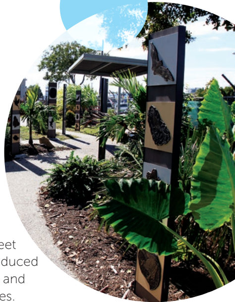
Image 19: 7th Lane Street Art.

In 2015 The Mackay Horizons pieces were relocated as an artwork trail within the Showgrounds as part of the City Centre Revitalisation Project.