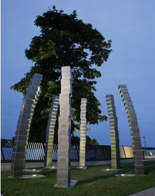
Fiona FOLEY Sugar Cubes 2009. Bluewater Quay, next to the 'Leichardt Tree' adjacent to Brisbane St.