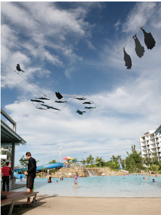
Fiona FOLEY Crows 2009. Bluewater Lagoon.