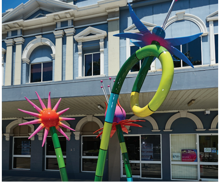
Brian ROBINSON Urban Bloom II 2015. Wood and River Sts intersection, in front of Telstra building.