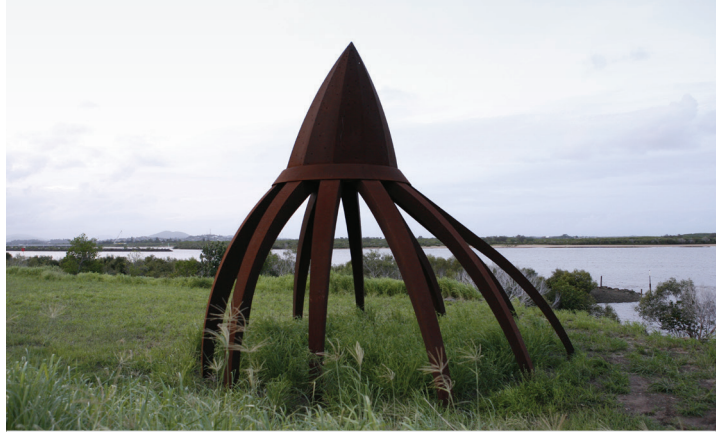
Fiona FOLEY Mangrove Cap 2009. Bluewater Trail, River St Park.