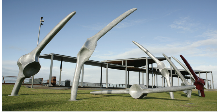
Fiona FOLEY Fishbones 2010. Bluewater Quay, corner of Sydney and River Sts.