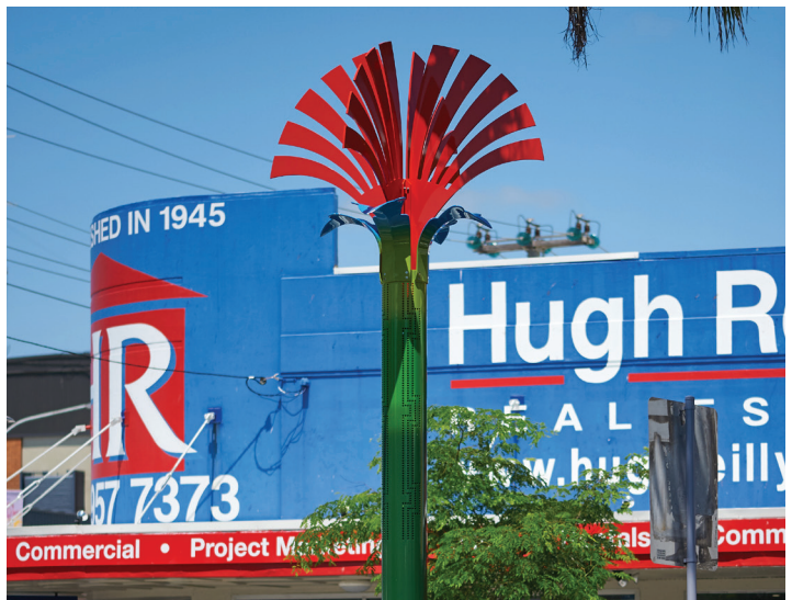
Brian ROBINSON Deco Bloom I 2015. Garden bed Wood St, at the intersection of Gordon Street.