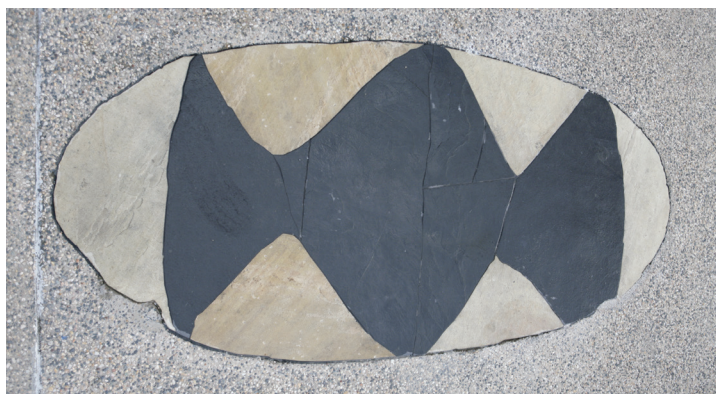
Fiona FOLEY Shields 2009. Water jet cut stone inlaid into paved surface, Bluewater Quay.