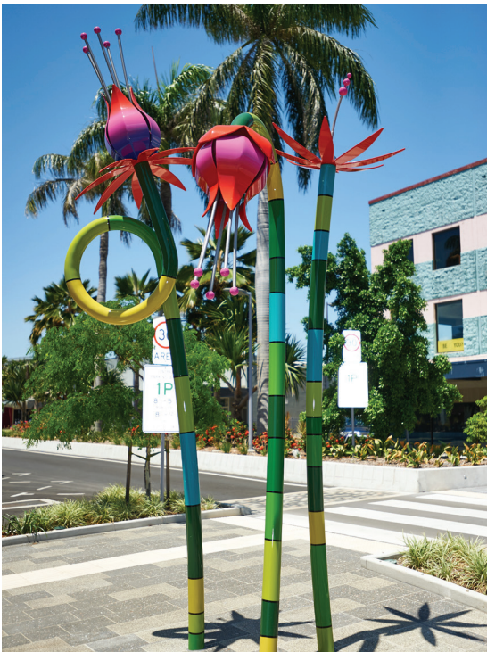
Brian ROBINSON Urban Bloom I 2015. Bump-out in front of Headspace, ex Daily Mercury building, 36 Wood St.