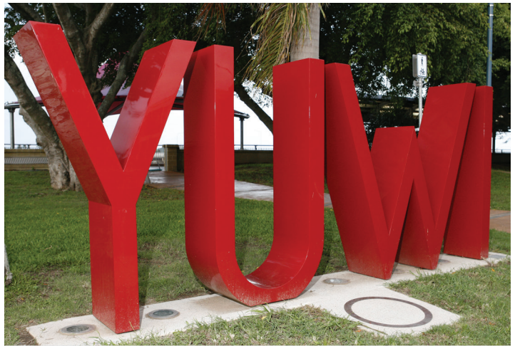
Fiona FOLEY YUWI 2009. River St (at the top of Wood St)