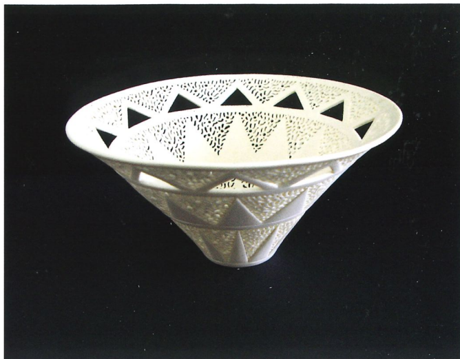
Sandra BLACK Carved porcelain bowl . 1994

The artists' book collection is available for viewing by appointment, in the Tate Adams Reading Room or through Meet the Collection (see Workshops and Events page).