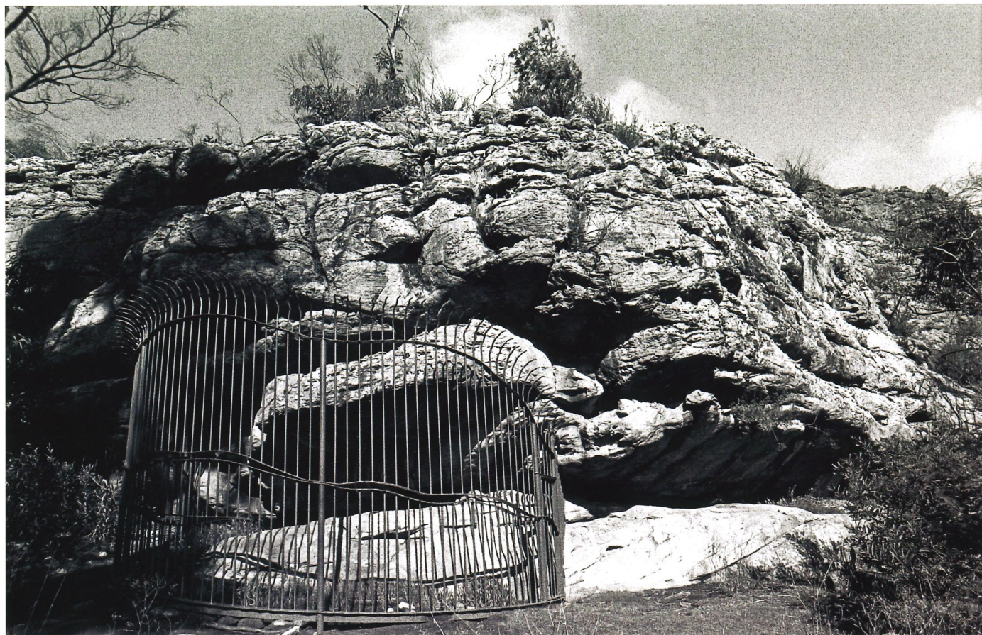
Jon RHODES Cage of Ghosts , Mt Stayplton, Victoria, 2001 (detail)