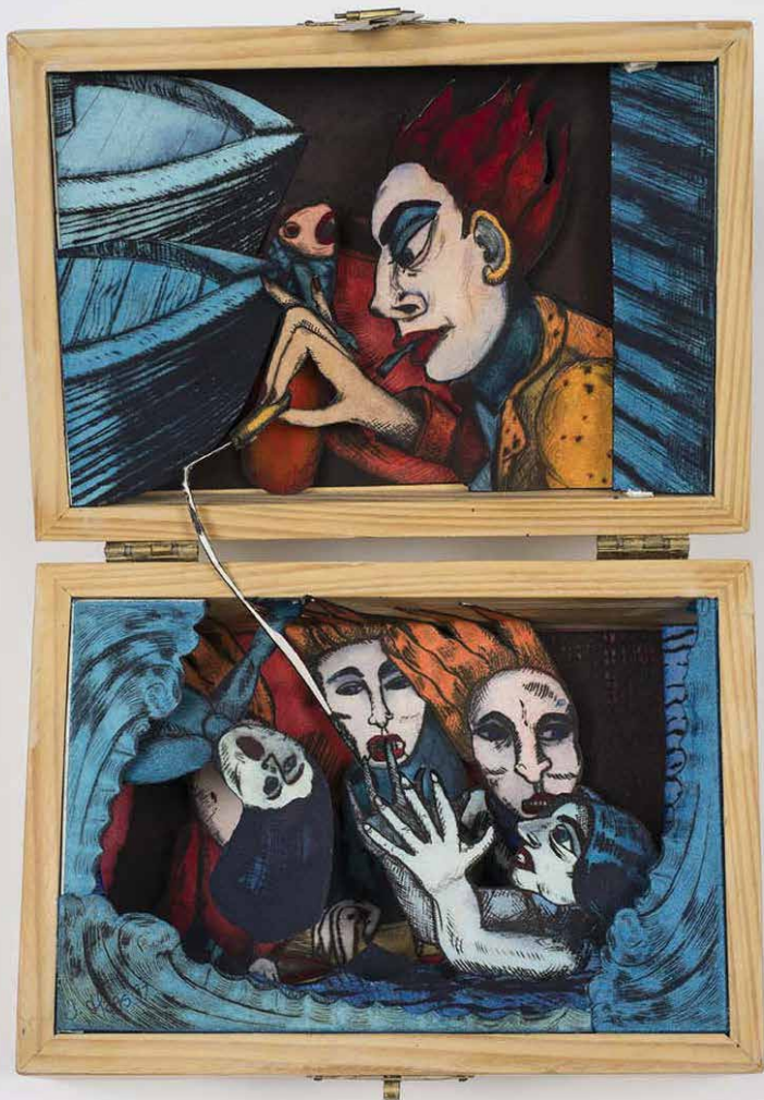
IMAGE: Juli HAAS Not waving: Walrus box V 1997. Pine timber box, brass clasp, hand-cut and hand-coloured paper. 11.8 x 17.0 x 7.5 cm. Mackay Regional Council Collection, Artspace Mackay.