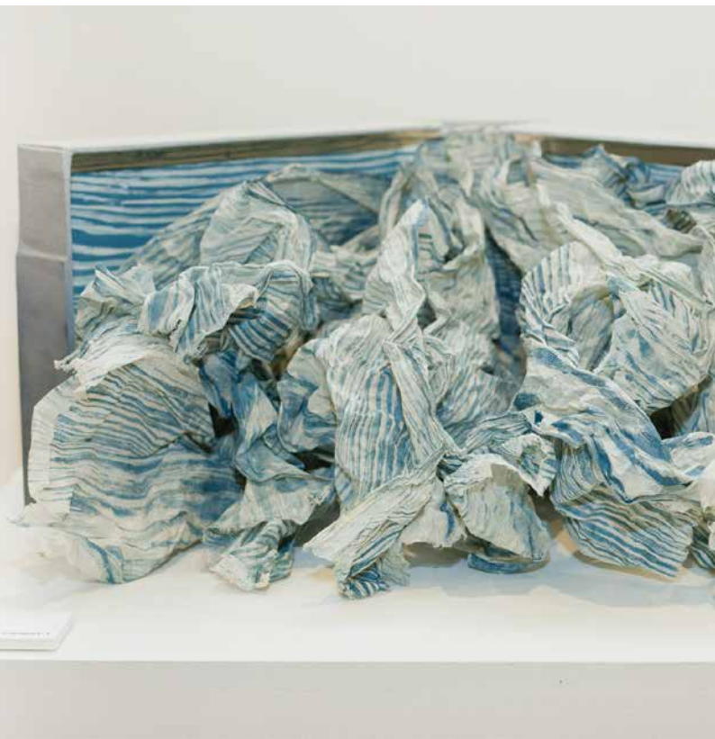
IMAGE: Michele SKELTON Wave form 2013. Woodblock print. Mackay Regional Council Collection, Artspace Mackay. Libris Awards: Australian Artists Book Prize 2013 WINNER Dalrymple Bay Coal Terminal National Artists Book Award.