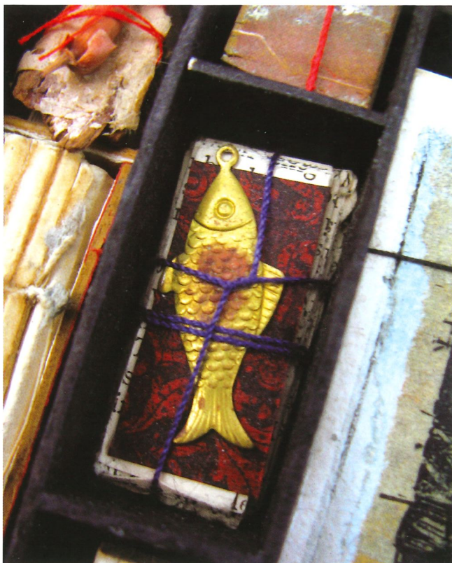
Glen SKIEN Boxed diary II (detail) 2004. Mackay Regional Council.