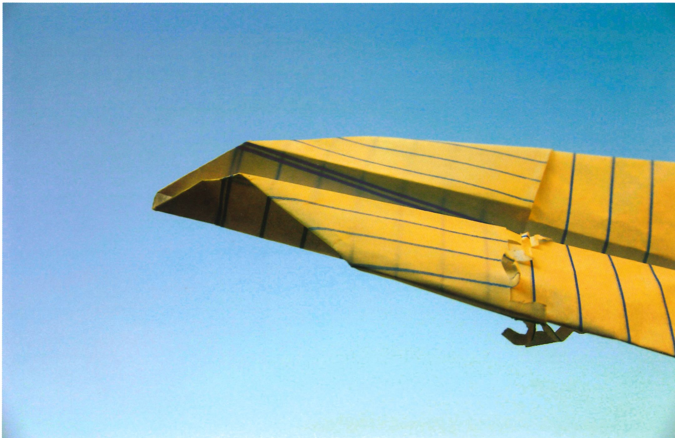
Patrick POUND Dart 2007. Photograph. Giclée print on rag paper.