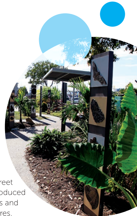
Image 19: 7th Lane Street Art.

In 2015 The Mackay Horizons pieces were relocated as an artwork trail within the Showgrounds as part of the City Centre Revitalisation Project.