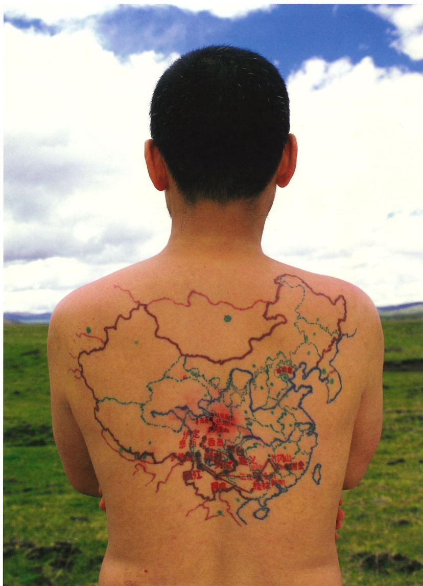
Qin GA The miniature long march (detail) 2002–05. Type C photograph, ed. 2/5. 23 sheets: 77.5 x 57cm (each). Purchased 2007. The Queensland Government's Gallery of Modern Art Acquisitions Fund. Collection: Queensland Art Gallery