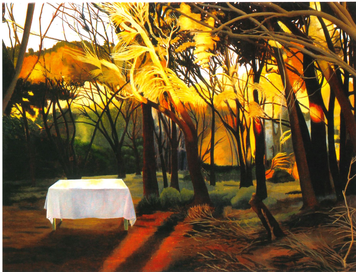
David KEELING Early morning 2003. oil on linen. 90 x 120cm