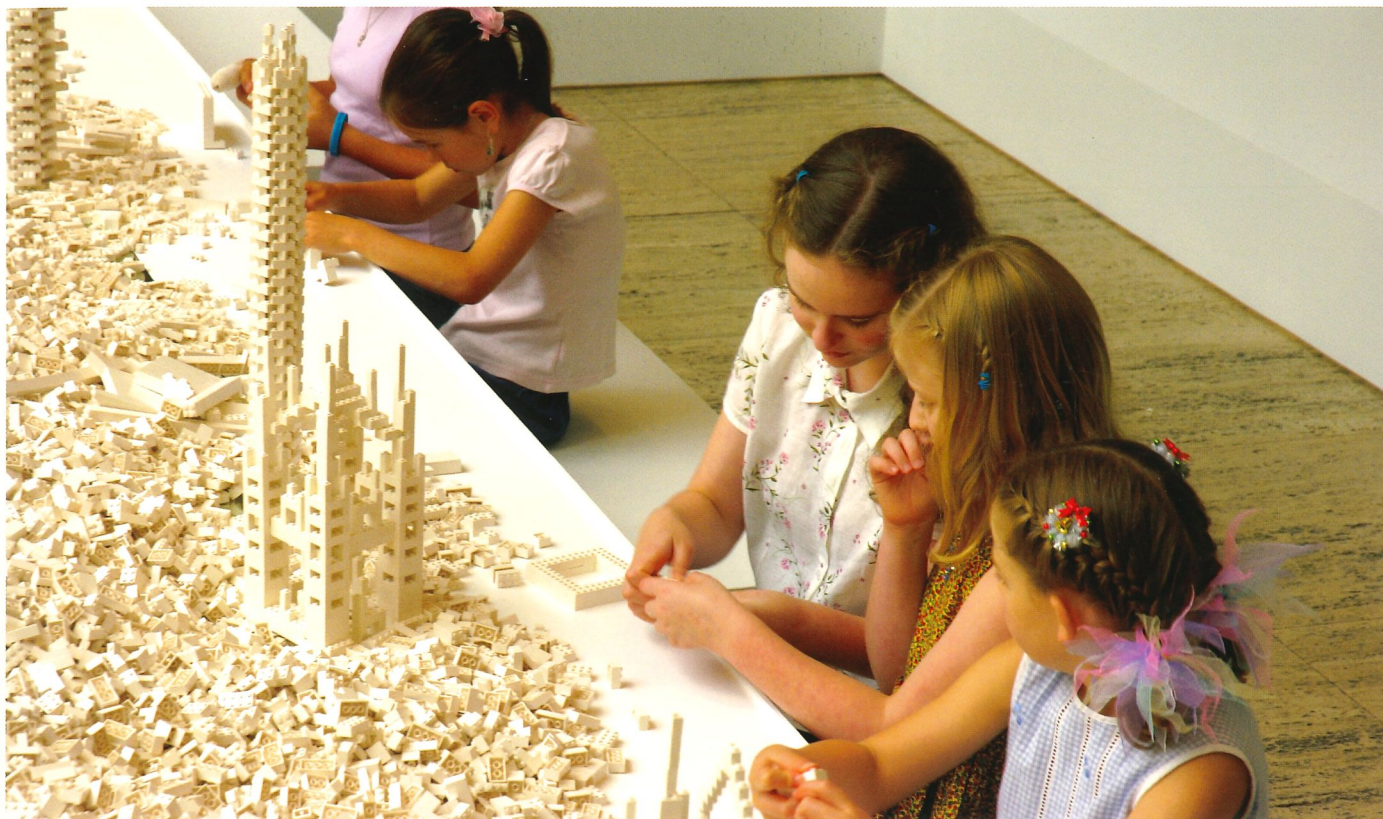
Children participating in Olafur Eliasson's The cubic structural evolution project 2004. White plastic Lego blocks, wood, mirror. Purchased 2005. Queensland Art Gallery Foundation Grant. Collection: Queensland Art Gallery.