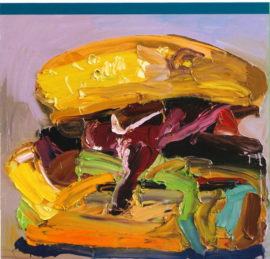
Ben Quilty The lot 2006, oil on canvas. 160 x 170 cm