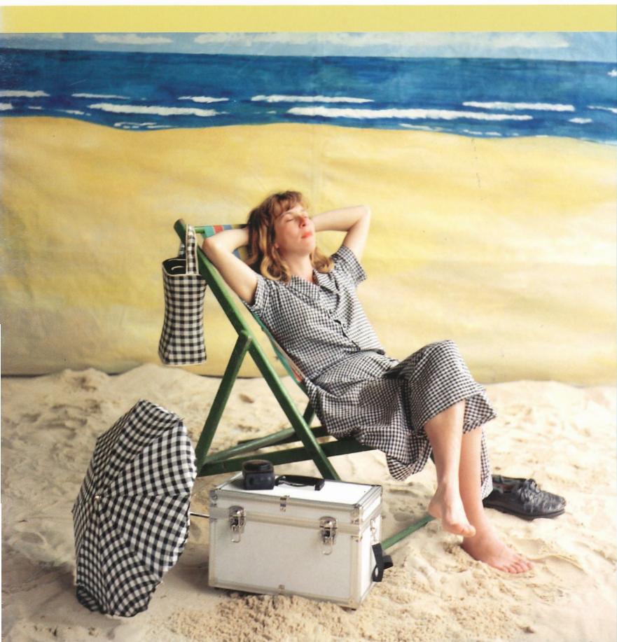
Anne ZAHALKA The photographer (self portrait) 1989. Type C photograph.