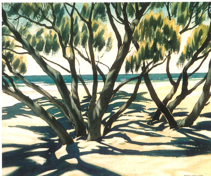
Kenneth MACQUEEN Under the casuarinas, Maroochydore . c.1937–38. Watercolour over pencil on paper. 39.2 x 46.3cm. Purchased 1944. Collection: Queensland Art Gallery.