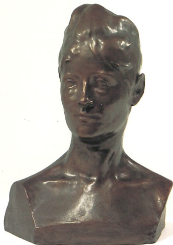
Paul Gauguin, France 1848–1903. Madame Schuffenecker c.1890, cast c.1960. Bronze, at least 20 casts. 44 x 32.5 x 18cm. Purchased 1982. Queensland Art Gallery Foundation.