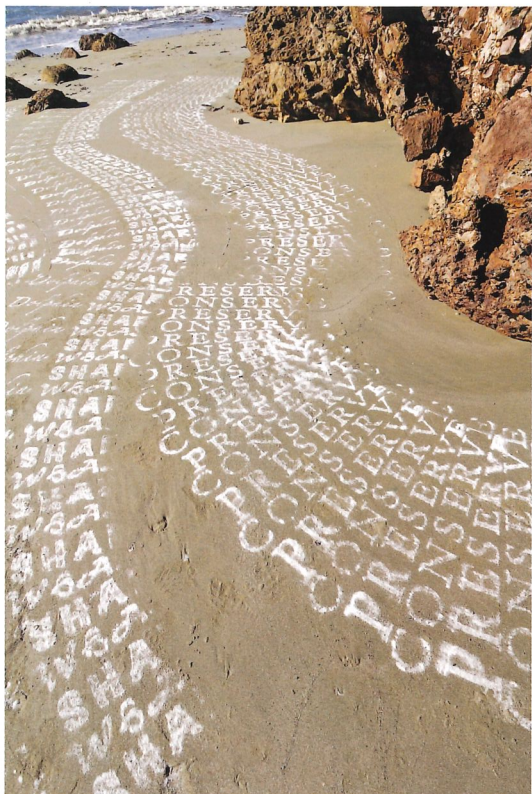
Jill CHISM Preserve/Conserve - an invocation (detail) 2008. Sea salt, PVC pipe. Cape Hillsborough National Park.