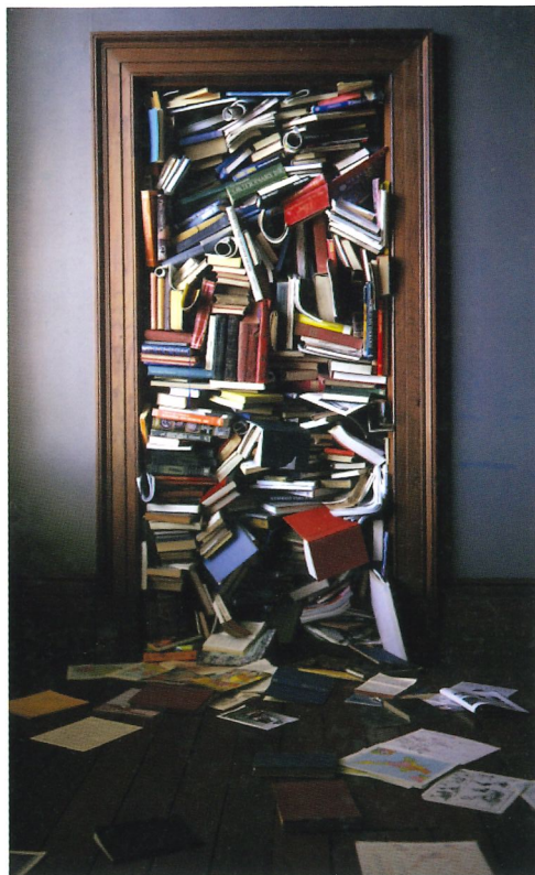
Jayne DYER A Reading 3 2008. Digital prints on aluminium. 198 x 120cm.