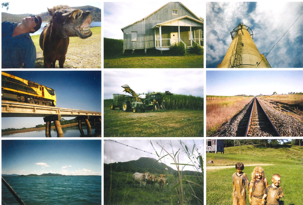
Snapshots of remote communities project, 2009