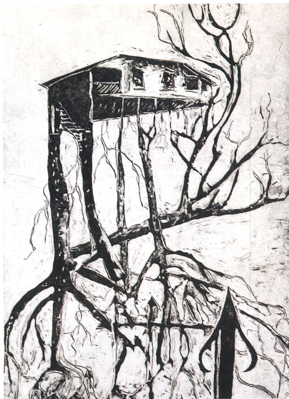
Irene COBURN Reclamation I 2009. Etching. Courtesy of the artist.