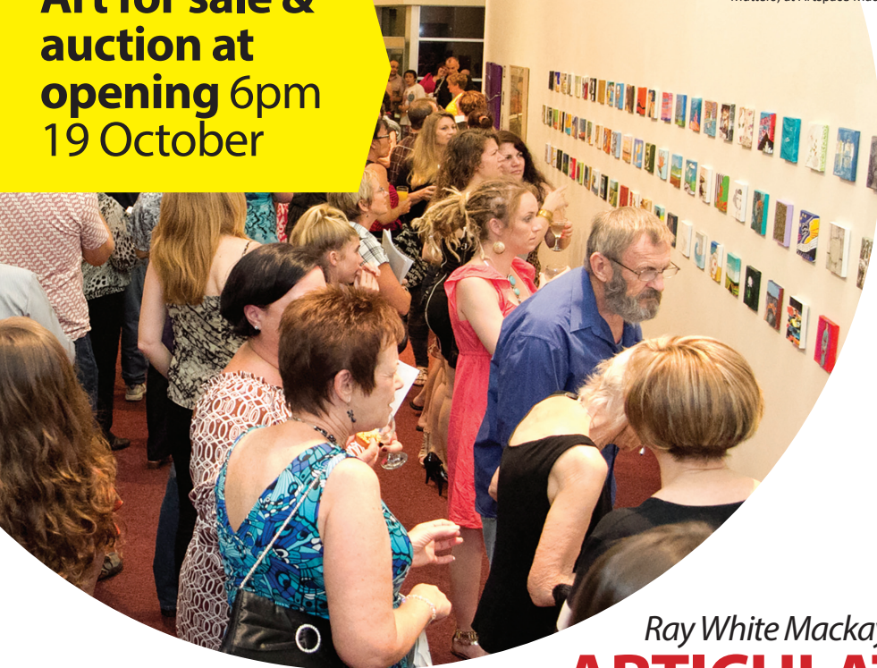
Image: Public attending Artspace Mackay Foundation's Postcard exhibition, Subject Matters , at Artspace Mackay in 2011.

Art for sale & auction at opening 6pm 19 October