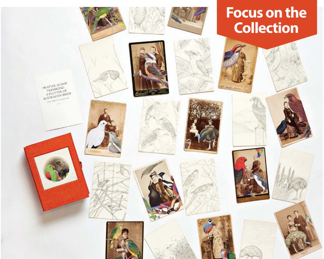
IMAGE: Gracia HABY, Louise JENNISON Prattle, scoop, trembling: a flutter of Australian birds 2016, collage and pencil on cabinet cards, pencil and metallic paint on Fabriano Artistico 640gsm traditional white hot-press paper, clothbound Solander box. Mackay Regional Council Art Collection. Purchased with Dalrymple Bay Coal Terminal Fund, 2016.