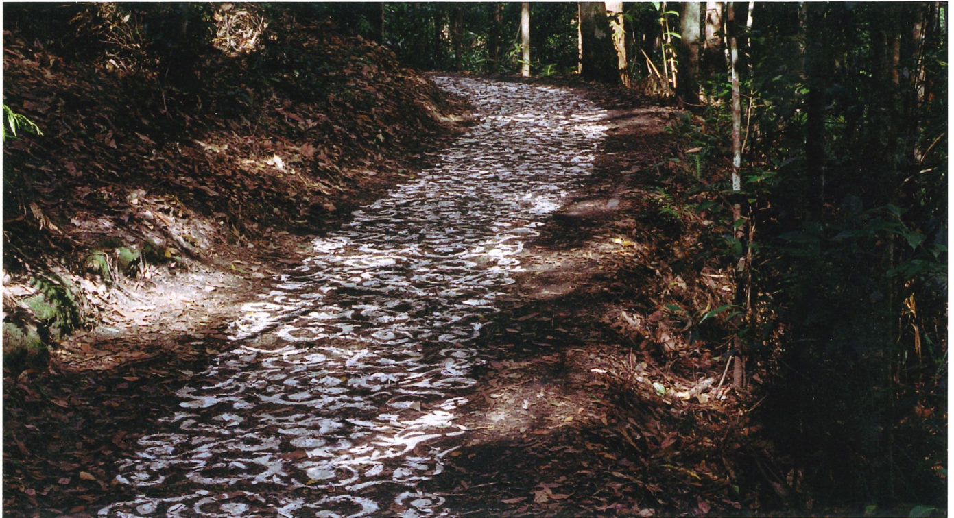
Elizabeth WOODS Princesse Kondallila (detail) 2005. Ephemeral installation, powdered clay. 200m. Series of two photographs 83.5 x 66.5cm.