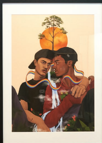
IMAGE: Installation view, Dylan Mooney: Boundless , Foyer Gallery, Artspace Mackay, 2022.