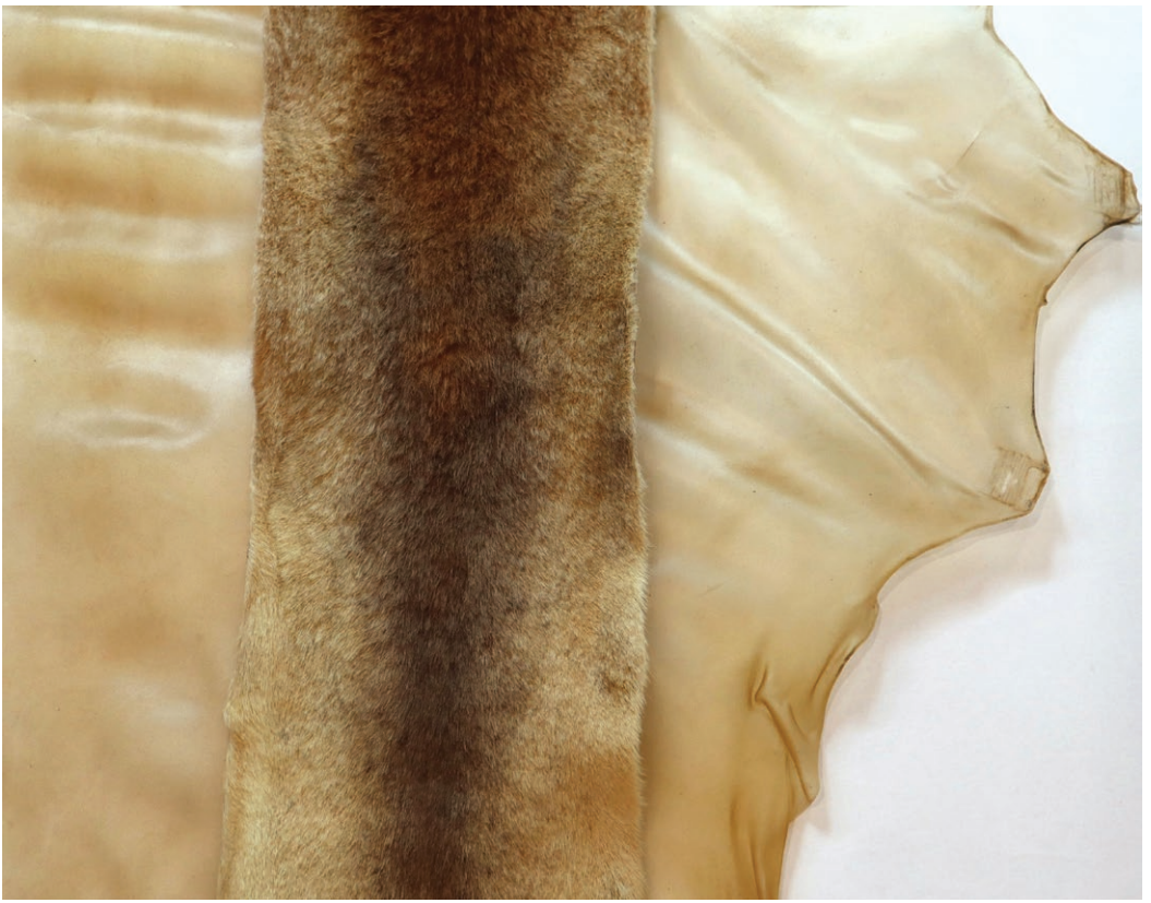
IMAGE: Mandy QUADRIO Croatee kanne menyenner / tales of 60,000 years (detail) 2024.