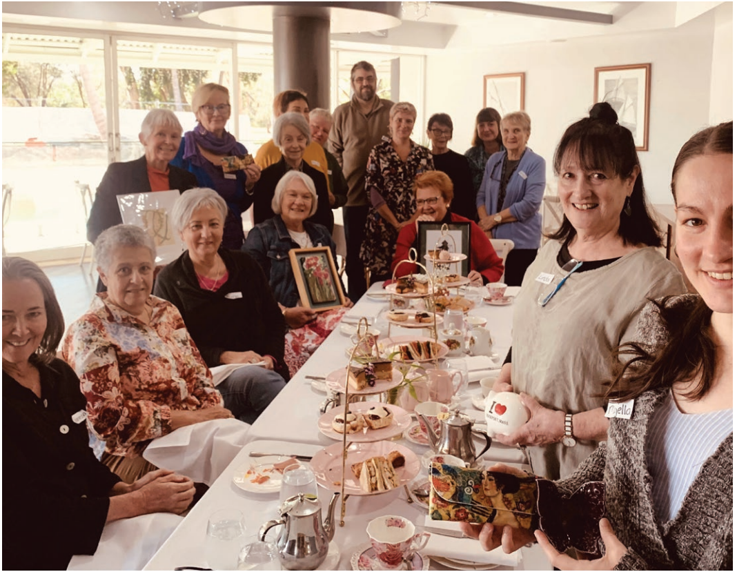
IMAGE: Artspace Volunteers taking a break from their gallery roles to enjoy a high tea social event, 2023.