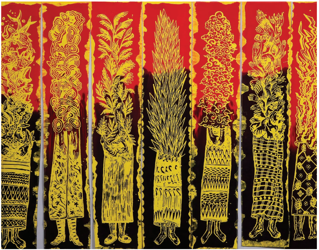
IMAGE: Dias PRABU We and the Universe 2 (detail) 2023, batik with synthetic dyes on fabric, 146cm x 29.5cm.